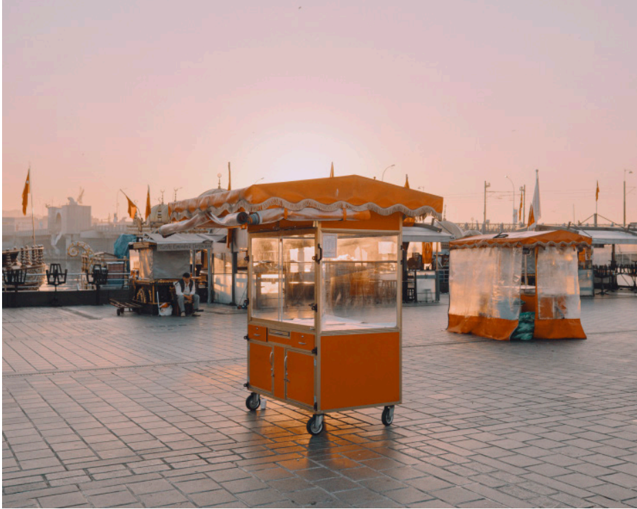
The Last Ever Picture Taken in Eminönü 2021 40x50cm Hahnemühle Matt Fibre