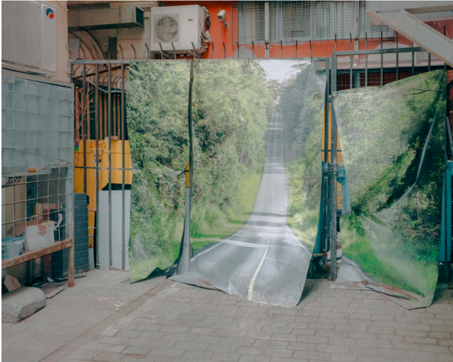
I Found a Portal in Karaköy 2020 40x50cm Hahnemühle Matt Fibre