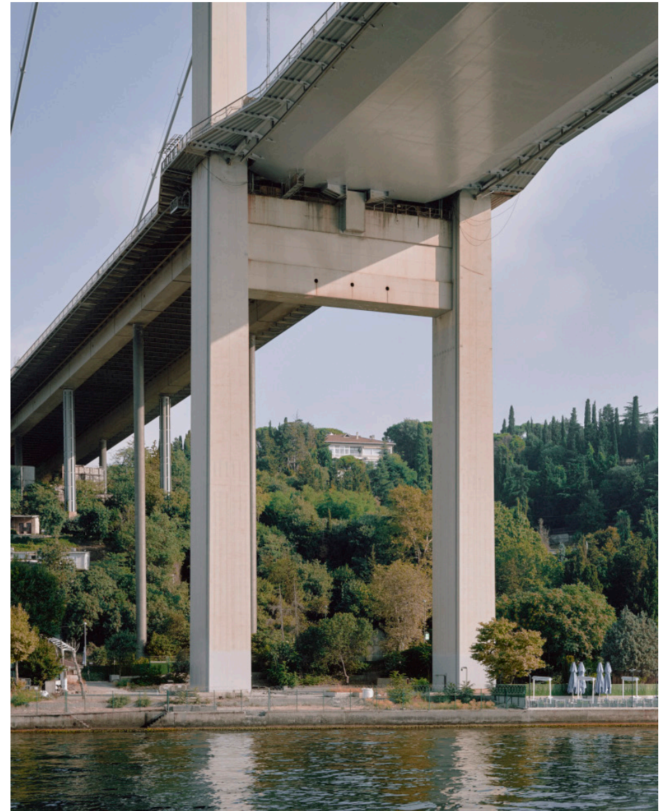
Welcome to Asia/Europe 2025 40x50cm Hahnemühle Matt Fibre