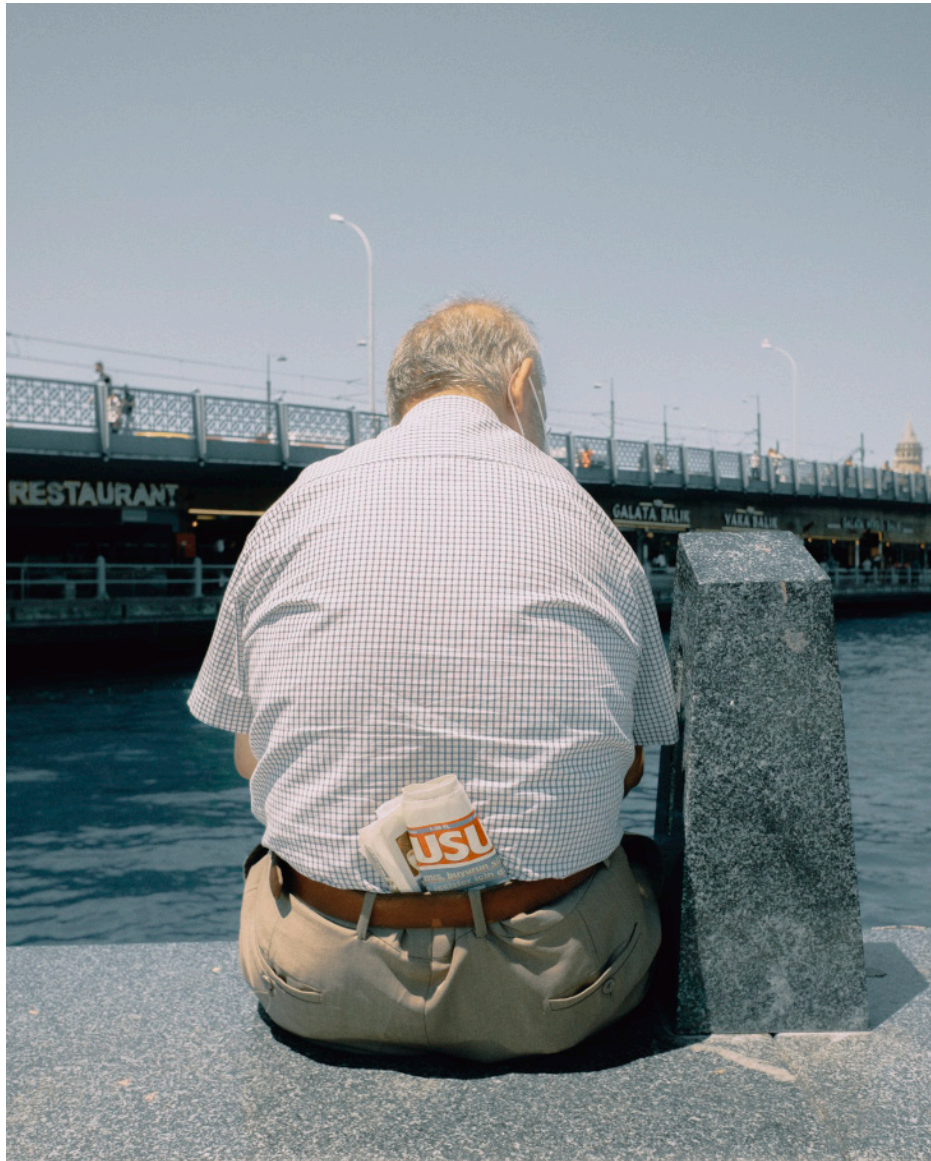
Il giornale 2021 80x100cm Hahnemühle Matt Fibre