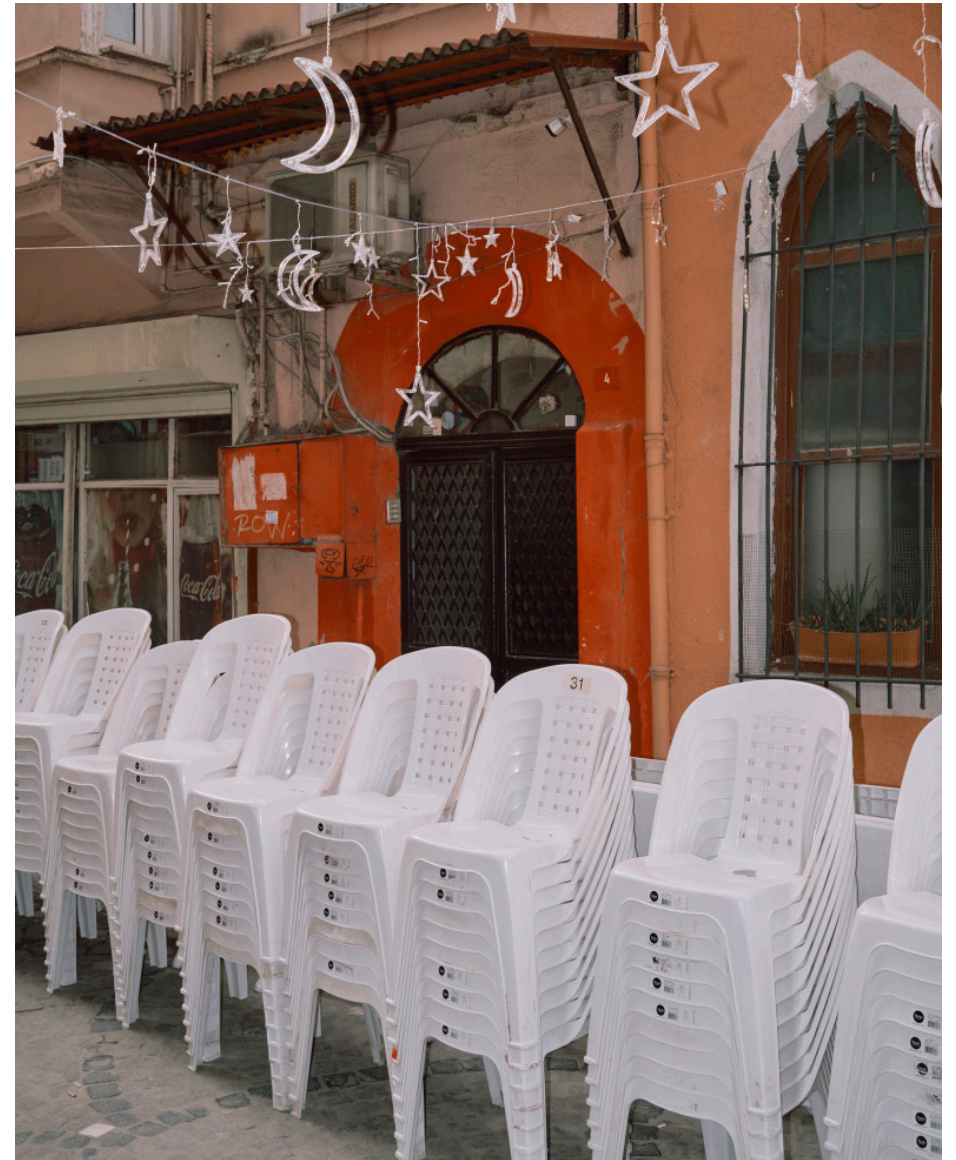
The Mundane Saved My Life, II. 2026 60x75cm Hahnemühle Matt Fibre