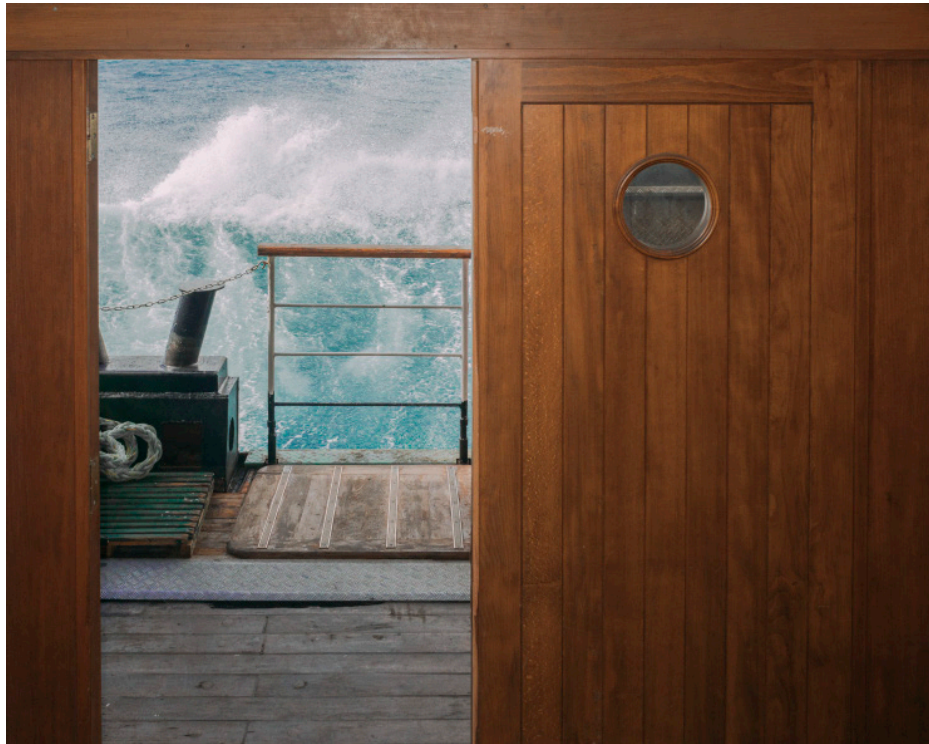
On the Way to Therapy, II. 2021 20x25cm Hahnemühle Matt Fibre