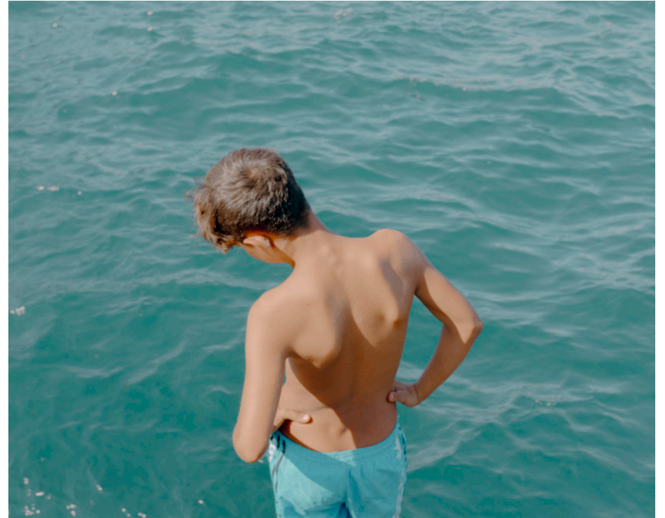
That's How People Grow Up 2021 20x25cm Hahnemühle Matt Fibre