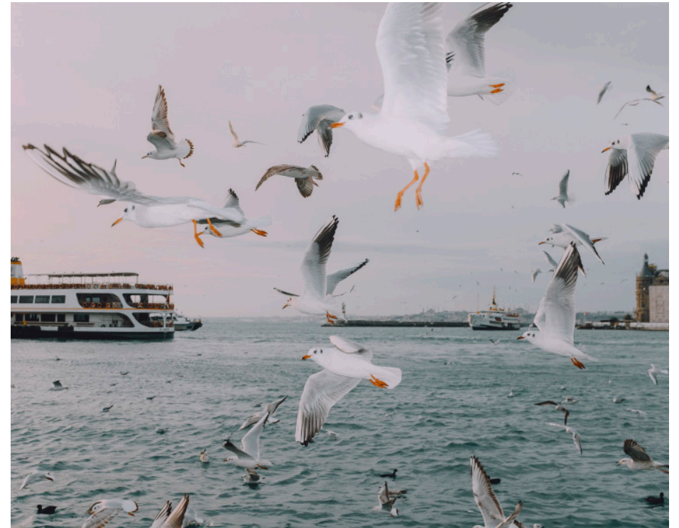
On the Way to Therapy, I. 2019 20x25cm Hahnemühle Matt Fibre