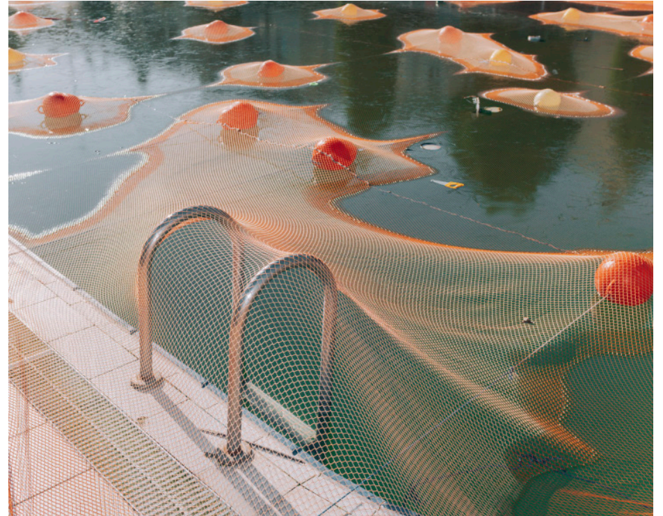
I Took Strange Pills 2019 80x100cm Archival Pigment Print on Diasec Mount