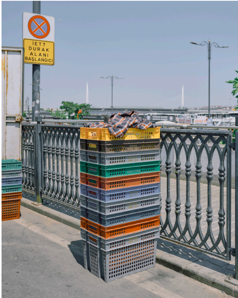
The Mundane Saved My Life 2025 60x75cm Hahnemühle Matt Fibre