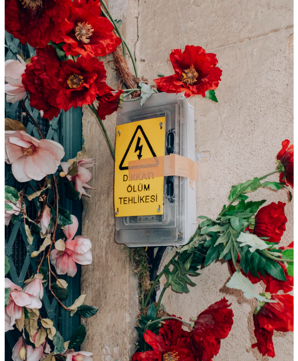
Signs That Everything Is Going Wrong 2022 40x50cm Hahnemühle Matt Fibre